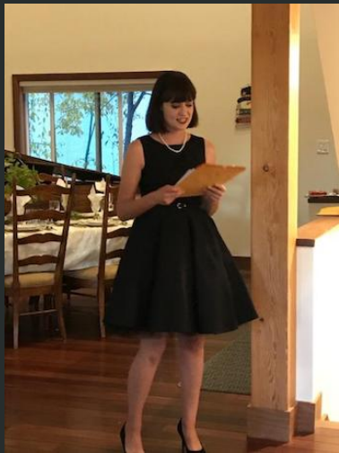
Murder Mystery Cabin Trip. Several of our members won a cabin trip at auction.