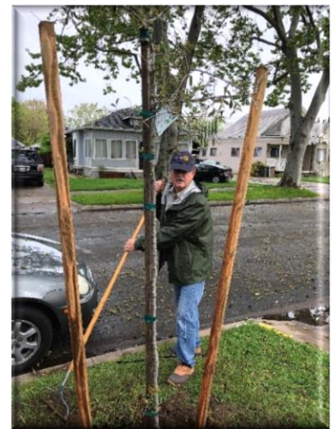
Unsettled Norwegian who thought he had been invited to an ice fishing social.